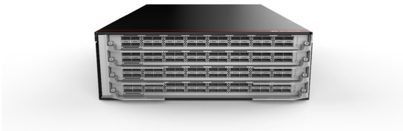
Typical 128 port 100G high density box switch

with single-chip switch devices has emerged in the market. This single-chip multi-plane interconnection solution is typically represented by a 12.8T chip, which can provide 128x100G port density on a single chip, and a single POD can provide access to 2,000 servers.